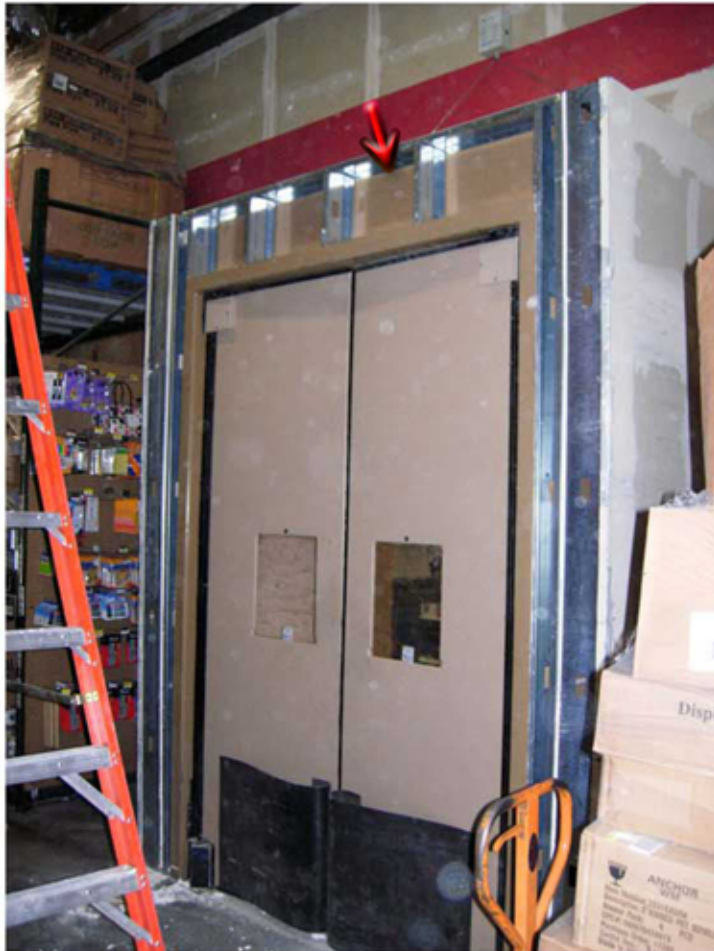
ADDING PLYWOOD FOR FUTURE STRENGTH