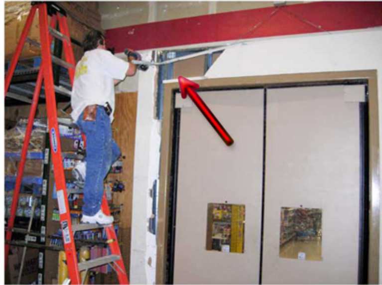
REMOVING DAMAGED DRYWALL