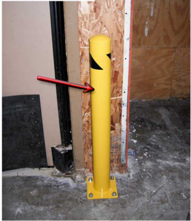
Door frame repaired