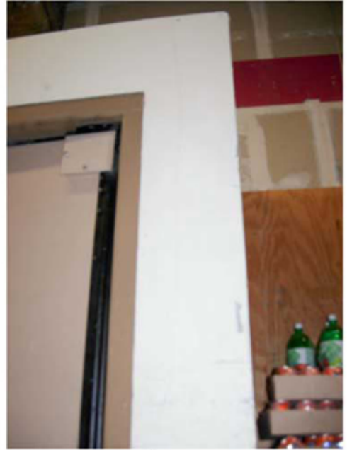
Damaged door frame